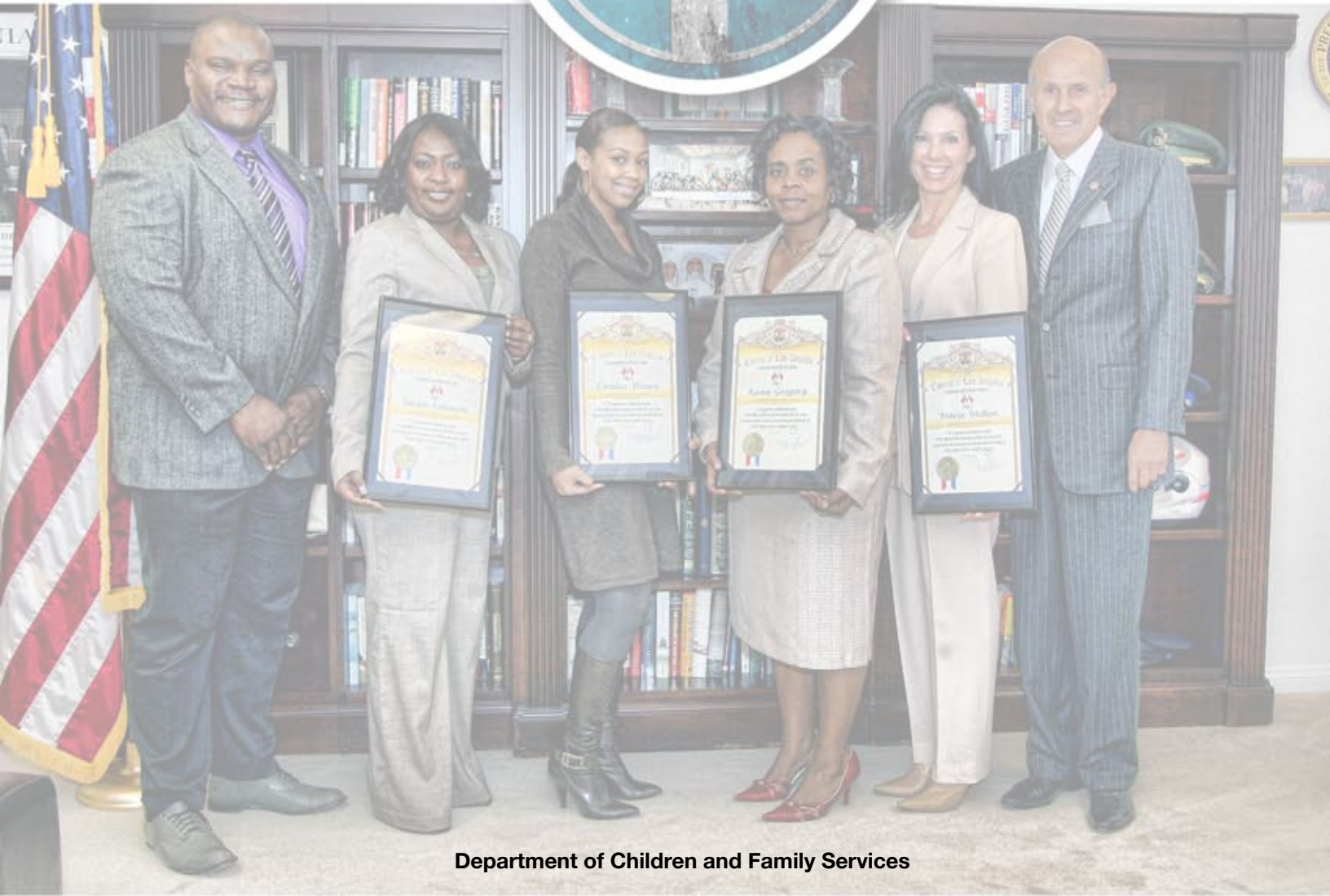
Department of Children and Family Services