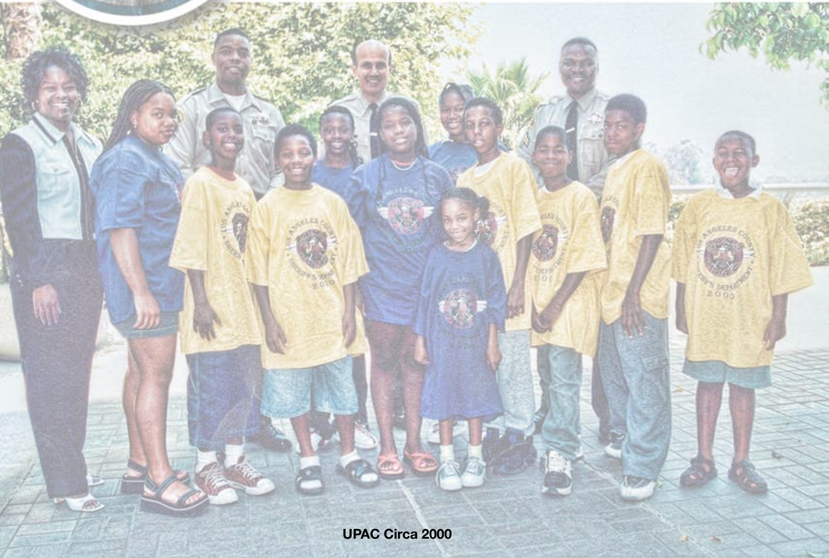
UPAC Circa 2000