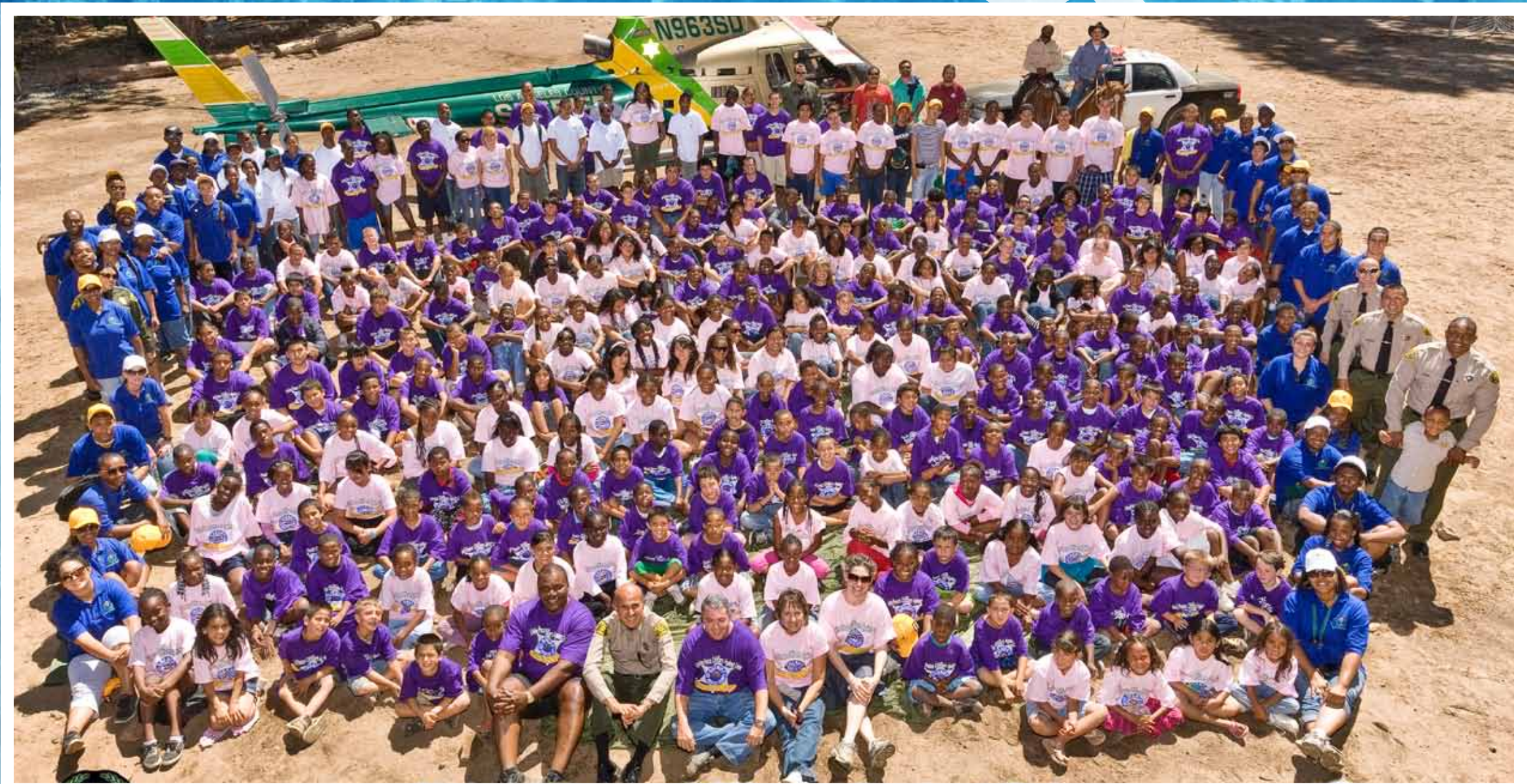
United Peace Officers Against Crime (UPAC)