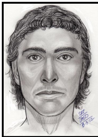
Artist's sketch from incident on July 28, 2012 in unincorporated Azusa