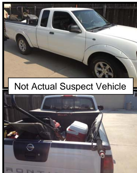
Not Actual Suspect Vehicle

SUSPECT: Hispanic Male, mid-20's to mid-30's, dark hair