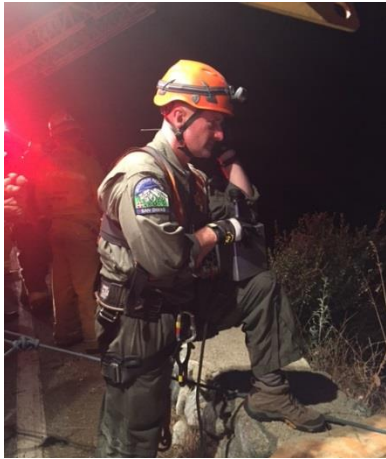
Trained experts - volunteers - staff the Mountain Rescue Team, and respond at all hours, day or night.

About 8:40 p.m. last night, San Dimas Station deputies responded regarding a vehicle over the side on Glendora Mountain Road about 6 miles north of Glendora. Deputies Ramos and DeMooy, the first emergency responders to arrive, learned that an Audi with six occupants crashed off the road, traveling about 300 feet down an embankment. Two occupants – the ones not wearing seatbelts - were ejected from the car.