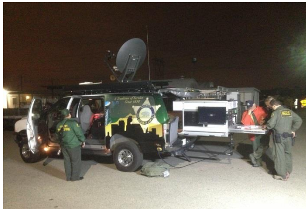
MCU-2 – Mobile Communications Unit

Search and rescue teams possess equipment capable of tracking the signals emitted from an aircraft's "black box" activated after a crash. Members from both counties' rescue teams were integrated into eight field teams, then given search assignments from a joint command post. Radio communications were facilitated by LASD's Sheriff's Communication Center (SCC), and radio work stations were manned by personnel from both departments.