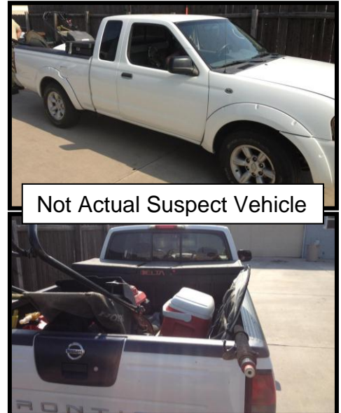
Not Actual Suspect Vehicle

SUSPECT: Hispanic Male, mid-20s to mid-30s, dark hair