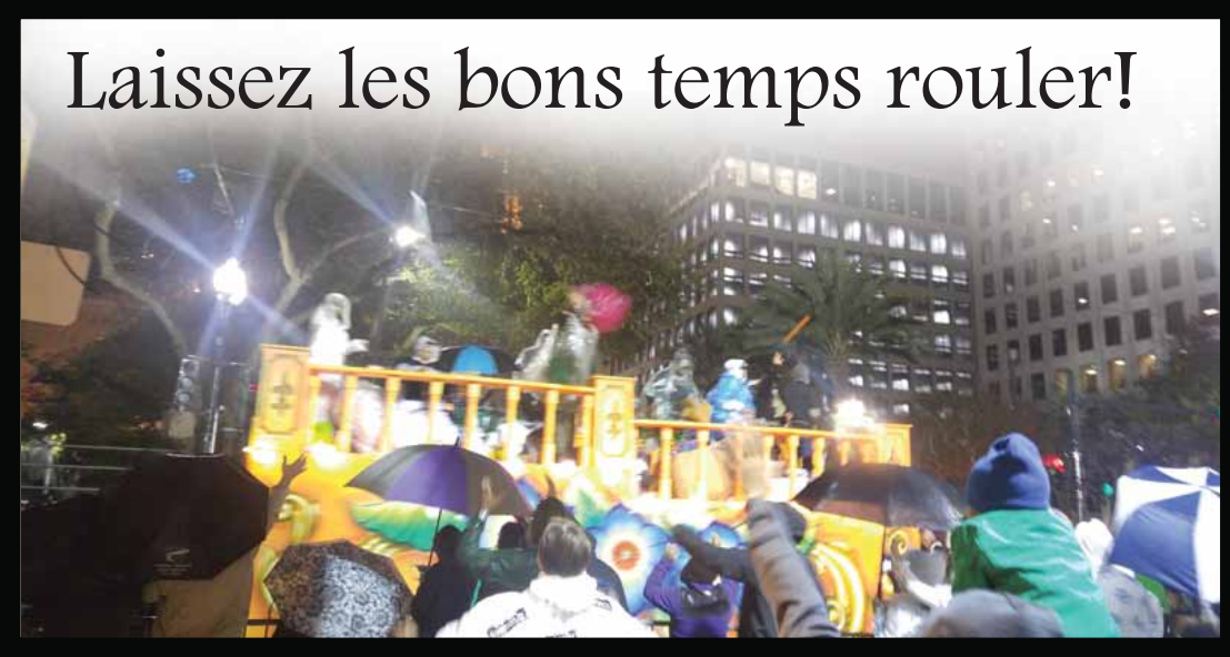
Above: On the street at Mardi Gras