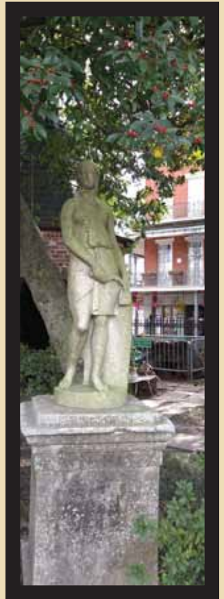
Above: A solitary statue in Jackson Square, French Quarter.