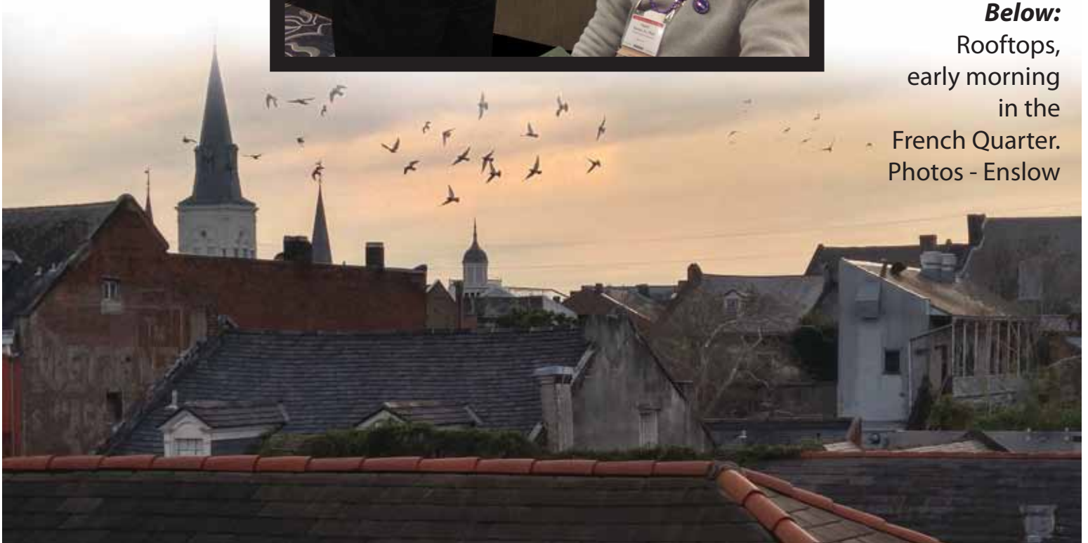
Below: Rooftops, early morning in the French Quarter.