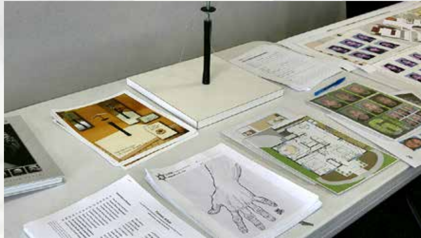
Examples of work brought in for discussion and review

Though we didn't pick the most optimal time to have this, we still had a nice turnout of agencies and FAs who brought shared experiences, best practices and interesting cases. The coffee was good, the juice was cold, the bagels were great and the cookies – the best! We will do this again in fall of 2017!