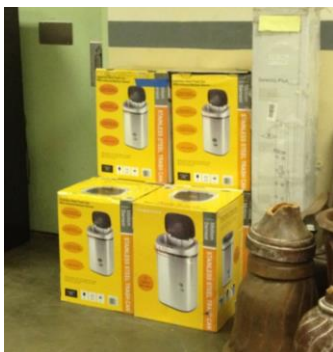
6 STAINLESS STEEL MOTION SENSOR TRASH CANS