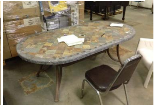
PATIO FURNITURE - TABLE