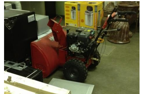
POWERLAND SNOW BLOWER