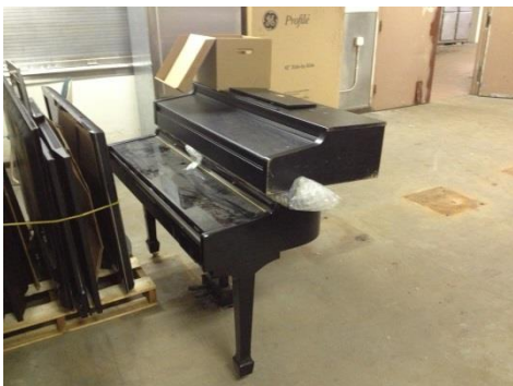
2 DIGITAL PIANOS (one is on top of the other)