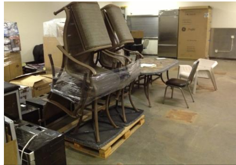
PATIO FURNITURE – CHAIRS & SIDE TABLES