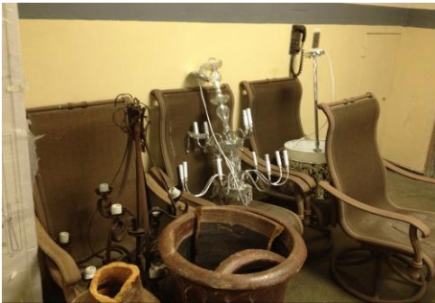
3 CHANDELIERS w/PATIO FURNITURE