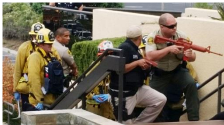
Approaching the building.