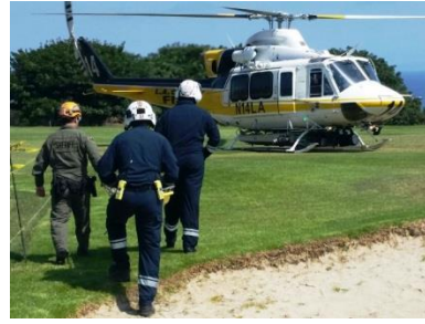
Carrying a mock-victim for helicopter transport.