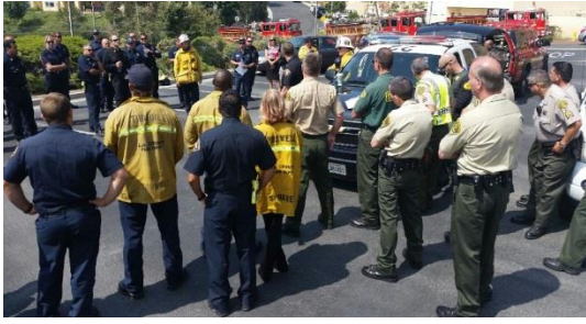
Debriefing the drill.