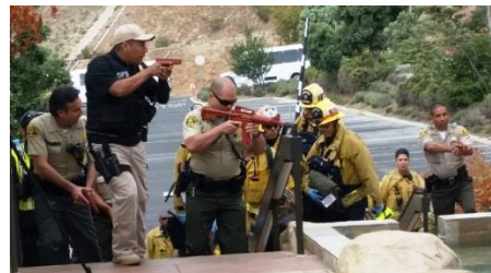
Approaching the building.