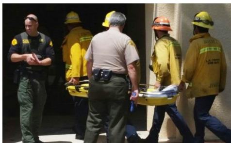
Deputies escorting fire personnel into the Warm Zone.